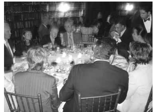
Happy Members and Guests