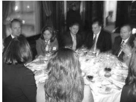
Happy Members and Guests